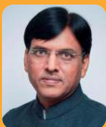
Dr Mansukh Mandaviya

Hon'ble Union Minister of Health & Family Welfare Chemicals & Fertilizers Government of India